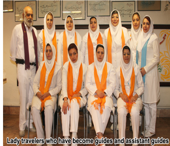
Lady travelers who have become guides and assistant guides