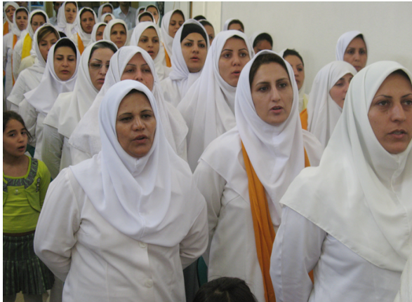
Assistant guides for companions singing the redemption song

perform different kinds of music for these occasions.