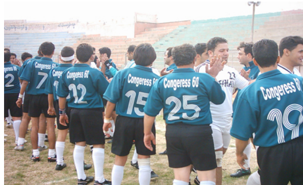
Congress players before their match with Esfahan Province