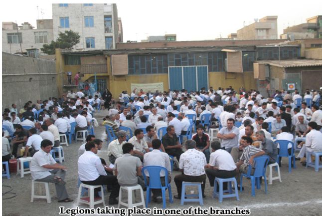
Legions taking place in one of the branches