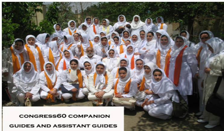
CONGRESS60 COMPANION GUIDES AND ASSISTANT GUIDES

is involved, one cannot help other addicts without the proper training.