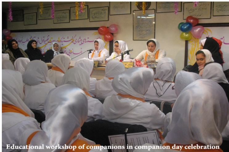
Educational workshop of companions in companion day celebration

We have two groups of companions in Congress60: a) the ladies who are the wives, sisters, mothers, and friends of the addicts, and b) the men who are the fathers, brothers, spouses, and friends of the addicts.