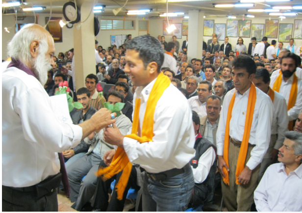
Thanksgiving ceremony for guides and assistant guides