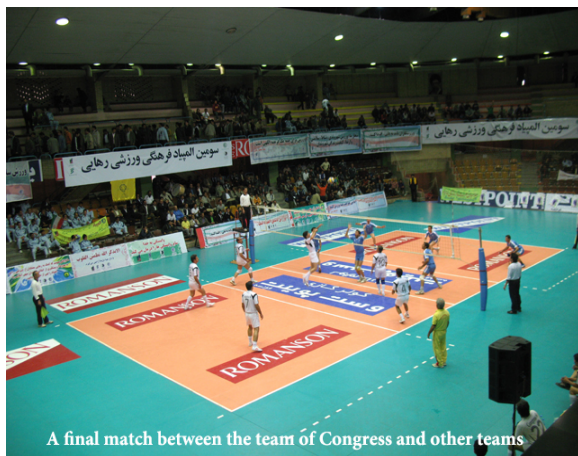
A final match between the team of Congress and other teams

Currently, sports are so important in Congress60 that in order to become a guide, the individual must have a sport in which he or she is fully active. This condition is also compulsory for the companions and families. I must remind you that we do not have a lot of support or facilities to conduct our sports program. We gather on weekends in a large park, and everyone stays busy with their own physical workout. Maybe it is hard to believe that our soccer players play on hard asphalt, darts are conducted between the trees, and chess is played on park benches. Of course, due to the great improvement that our rugby and archery teams have had so far, they practice and compete in suitable stadiums, along with an Olympic size pool for our swimmers. We started with the poorest level of facilities and gradually, things improved. For instance, the current coaches of our rugby and archery teams have previously managed the national sides.