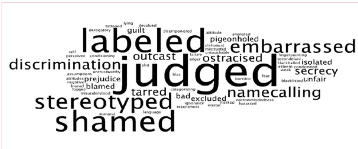
Figure 1: Graphical representation of the words used by focus group participants when asked what stigma meant to them

The negative attitudes that drug users experience and the impacts they have on them and their families are demonstrated by the way in which the people in our research focus groups responded when asked what stigma meant to them. 2